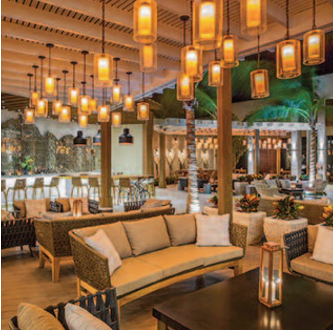
Courtyard Lounge at The Shore Club