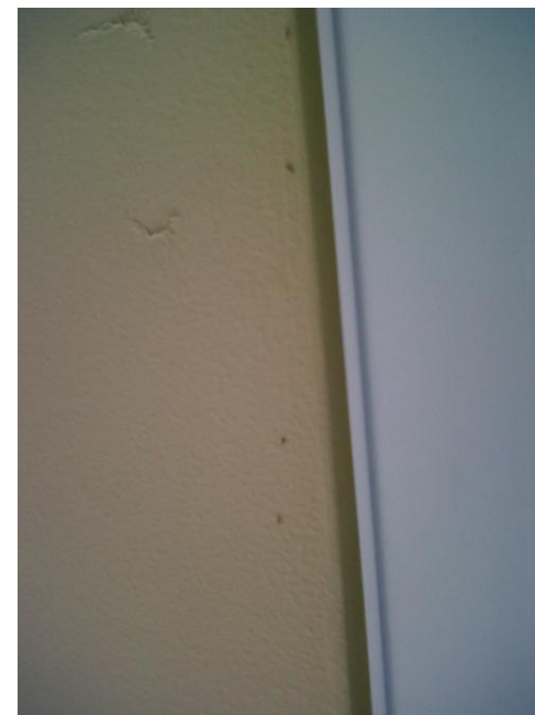
Damaged ceilings in Owners' Units – mold, bubbling & water