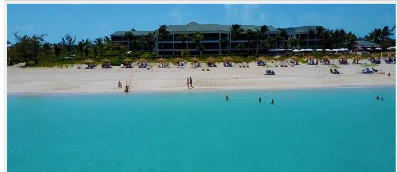
The Sands at Grace Bay.

The daily Turks and Caicos flights will be a significant new option for travelers looking to head to the Turks and Caicos, with flights starting at $59 one way — easily the cheapest flights to the destination on any carrier.