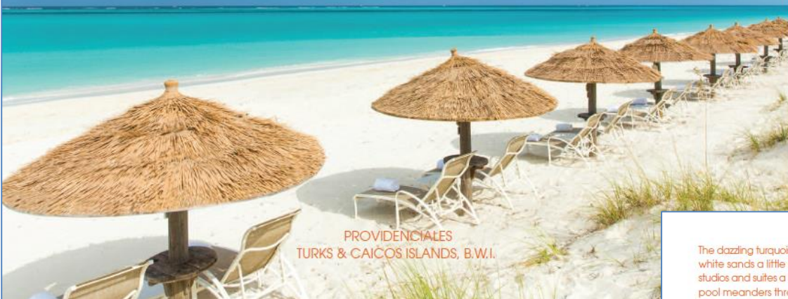
PROVIDENCIALES TURKS & CAICOS ISLANDS, B.W.I.

Like floating into your favorite post card.