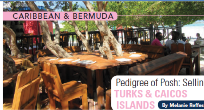
CARIBBEAN & BERMUDA